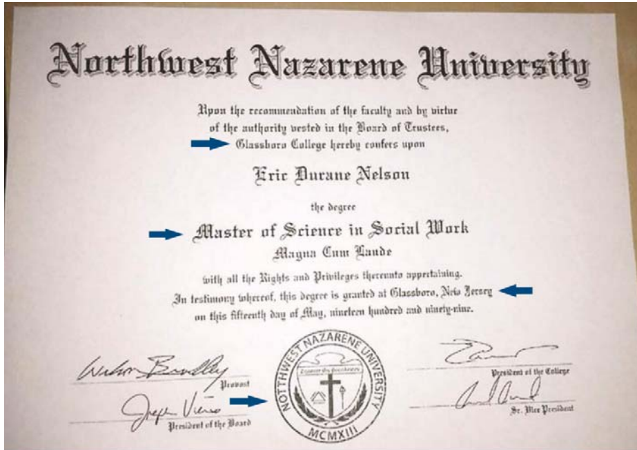
Figure 1 Diploma ERIC NELSON supplied (arrows added for emphasis) (PHOTO: The Aurora Sentinel )