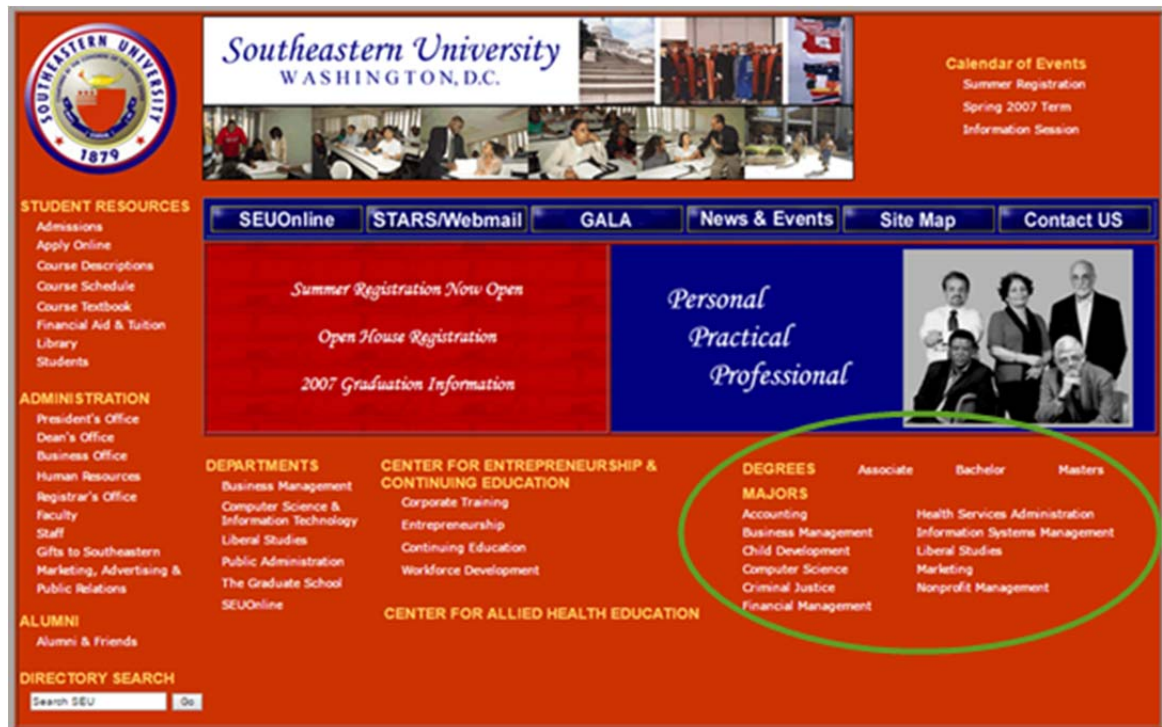
Figure 4 Snippet of 2007 archived web page

In Figure 5 , the diploma that NELSON provided, we again see the “summa cum laude” honor associated with a higher degree when the majority of American institutions do not add honors to degrees above bachelor’s degrees.