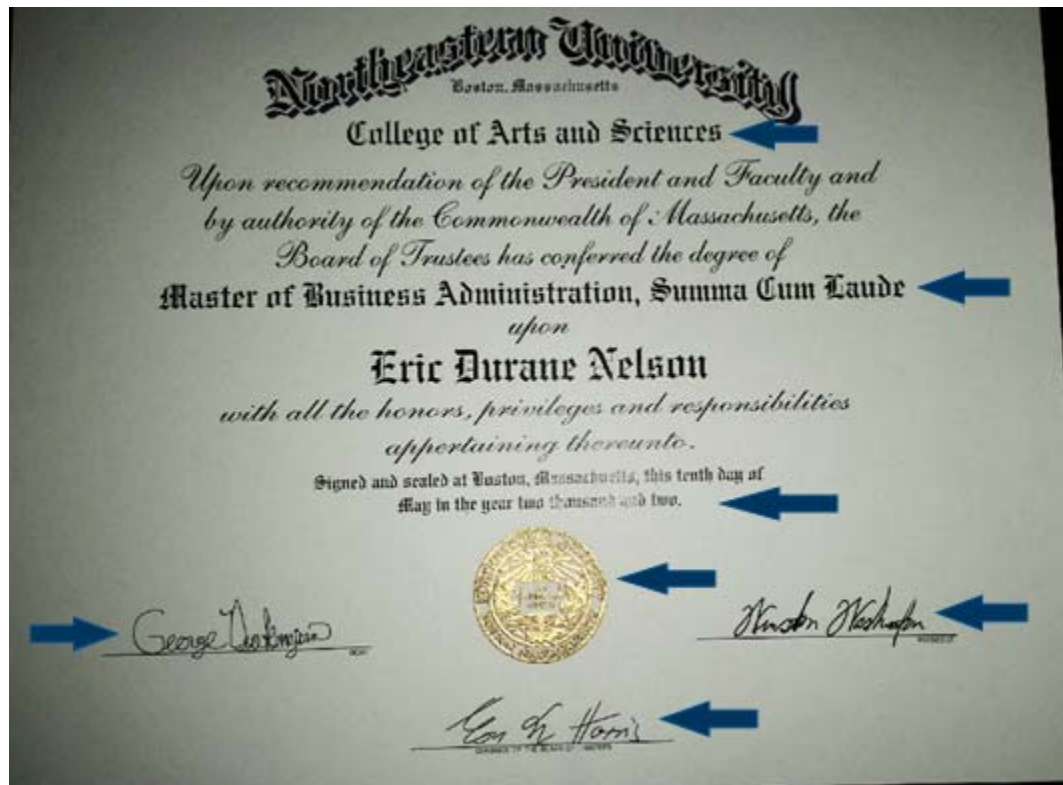
Figure 3 Diploma ERIC NELSON supplied (arrows added for emphasis)